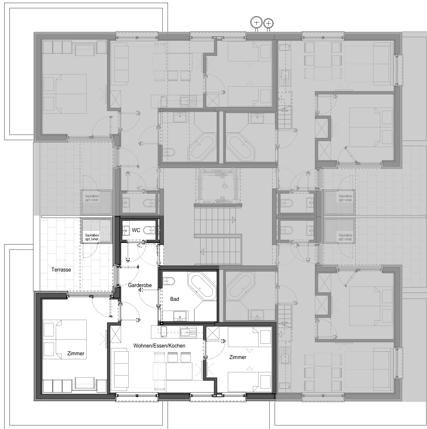
Grundriss Haus 2 E+5 M 1:100