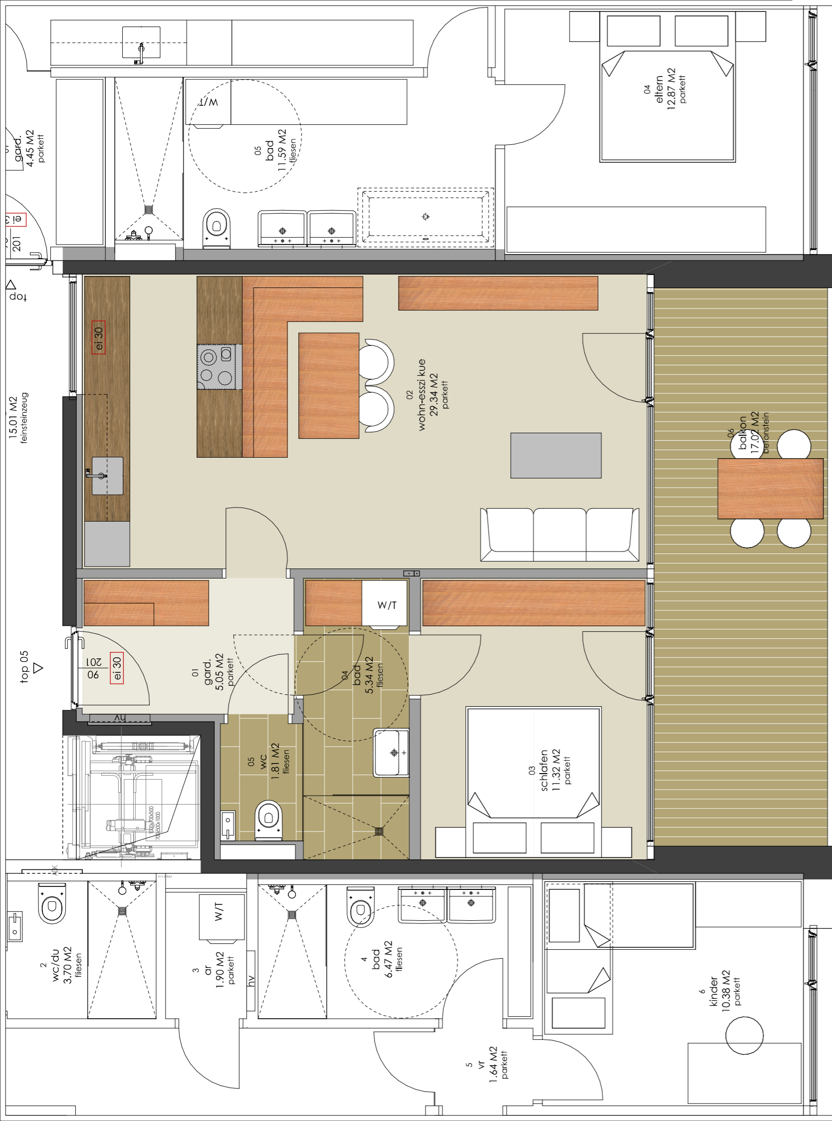
3-ZI WOHG.80,75 M2